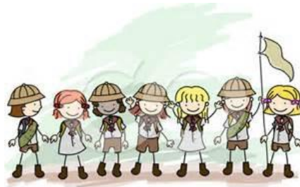
© BNP Design Studio * www.ClipartOf.com/1052219