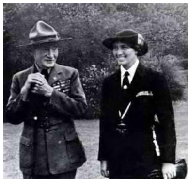
*Lord and Lady Baden Powell.