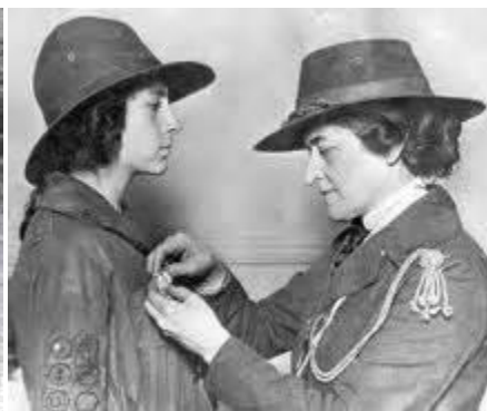
*Juliette Low with unidentified Girl Scout