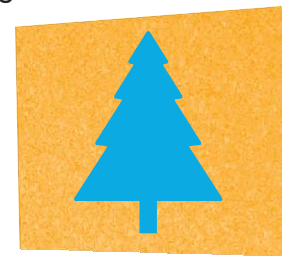
OUTDOORS Adventure and skill building, from the backyard to the backcountry, including through camping experiences for all ages