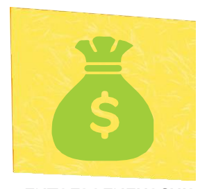
ENTREPRENEURSHIP The Girl Scout Cookie Program—the largest girl-led entrepreneurial program in the world—teaches goal setting, decision making, money management, business ethics, and people skills

Whether they complete Girl Scout Leadership Journeys, earn badges, run their own cookie business, pack for their first hike, change the world through Take Action projects, or any combination of these activities, at Girl Scouts, every girl has countless ways to explore our four program areas and hone the skills they'll need to power a lifetime of success—whatever that looks like for them.